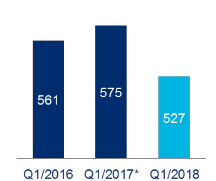
EBITDA (EUR million)